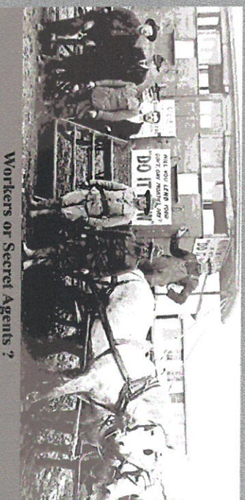
Workers of Secret Agents ?

Approximately 150 "Secret Agents" were assigned to Nitro as Labor Inspectors. They were infiltrated into the work force as "common laborers" to report on loafing, violation of rules, malingering or any other subversive activities that might occur. Also, 50 additional special undercover secret agents were sent to Nitro as military intelligence agents. They were concerned especially with matters that could prevent or slow down the work, such as labor agitation, strikes or sabotage.